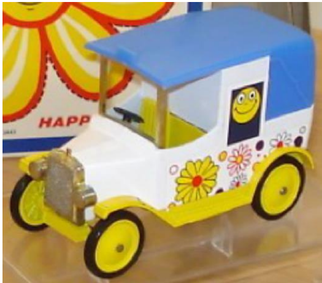
Above, below and right: As production reached its end, Happy Cabs began to appear without stickers on the roofs and hoods.