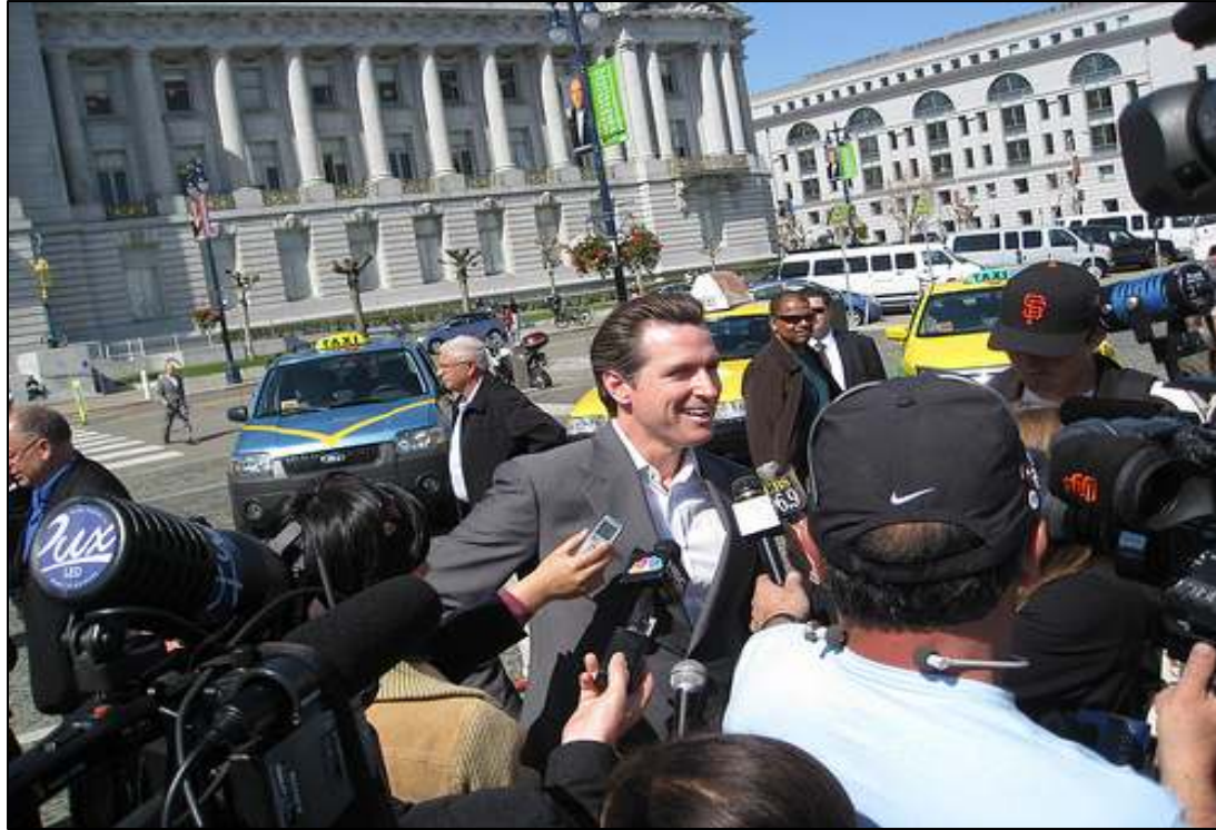
Mayor Gavin Newsom announces to reporters that the taxi fleet is 57% green in March 2010.

In 2008 the City of San Francisco set goals for reducing greenhouse gas emissions. The city let the taxi industry decide how to meet the goals by 2012.