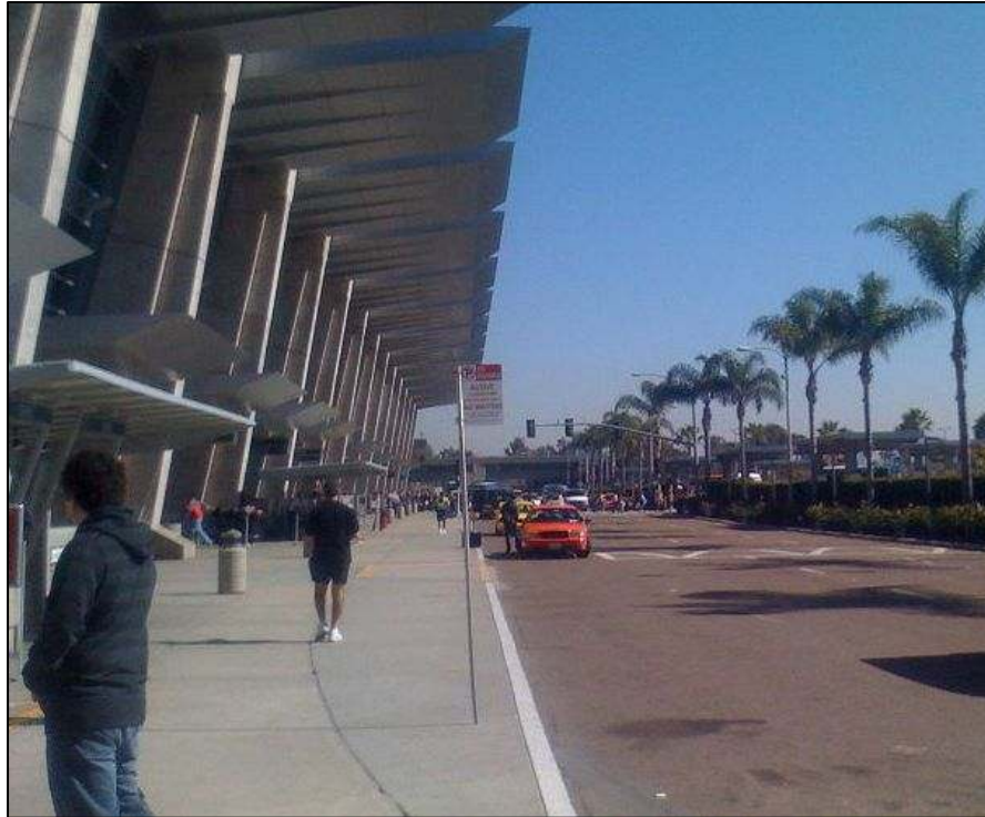
A taxi at the San Diego International Airport

SFO used a front-of-line incentive to encourage early voluntary adoption of CNG vehicles.