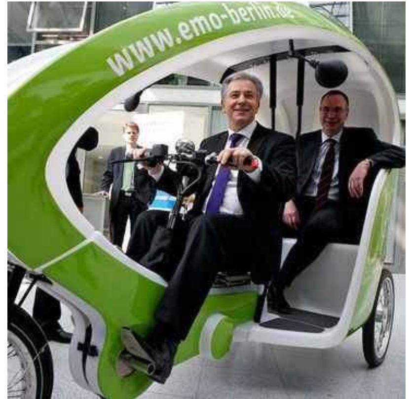
CCI (longer, wider) CCII (higher, suspension) new eVelotaxi 3600 Watt, 15% slopes (here with berlin`s mayor Klaus Wowereit)